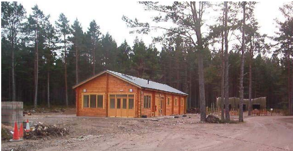
Fig. 2. Existing Shower/Toilet Block to be Extended