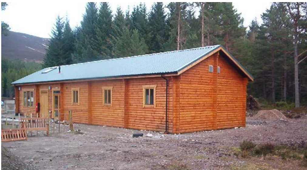
Fig. 3. Existing Shower/Toilet Block to be Extended